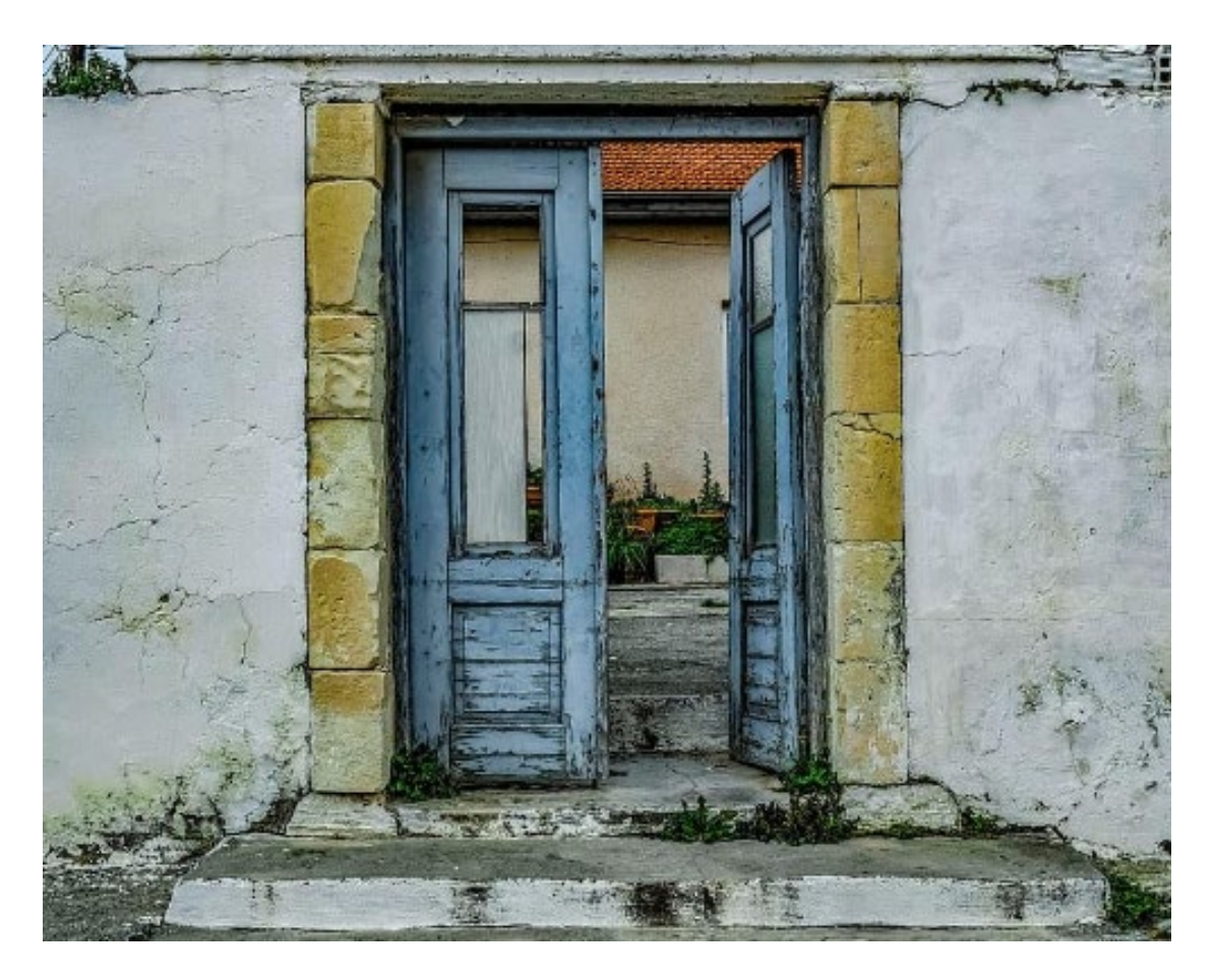
303 FORGE ROAD S.E. CALGARY

Please enter through side door off parking lot.