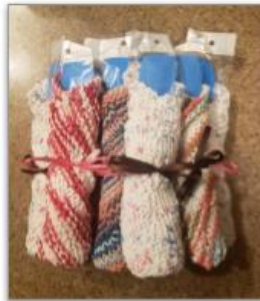
Kitchen Bundle 1 spatula and 1 dishcloth for $10