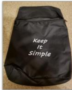
Backpack $10 each