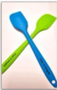
Spatulas 2 for $15