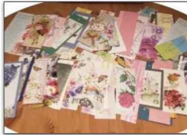
Bookmarks 1 for $1 or 3 for $2