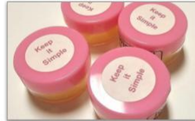
Lip Balm 1 for $3 or 2 for $5