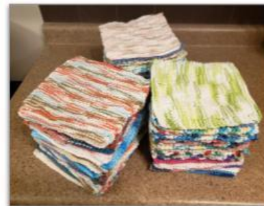
Dishcloths 1 for $4, 2 for $7 3 for $10, 4 for $12 5 for $15, 6 for $18 7 for $21, 8 for $24