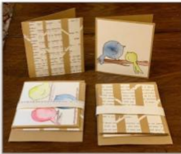
Greeting Cards 2 cards for $5

To order: Complete the Google Form on the website